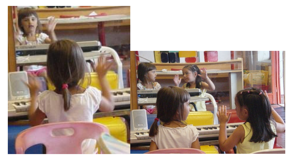
Figure 1: The turn-taking: The children lift up their hands when they pass the turn to the Continuator.