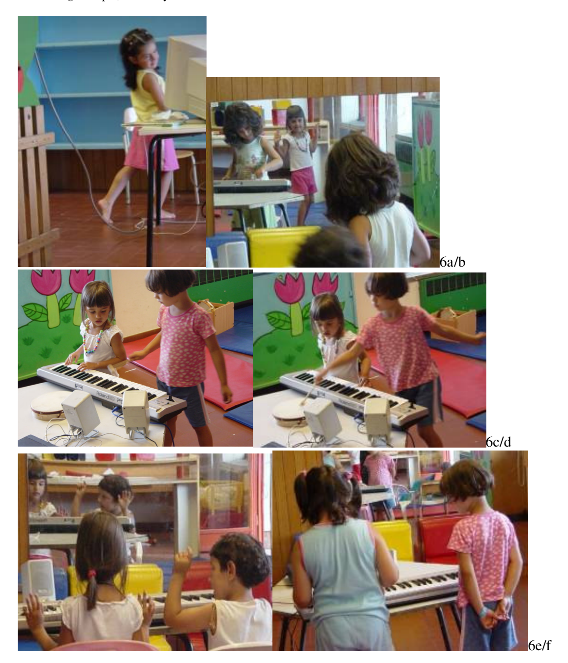
Figure 6: Free games. 6a/b The children improvise some dances on the notes played by the Continuator; 6c/d. Collaborative playing: A girl organizes a jam session with the Continuator and her friend, and she plays alternatively the keyboard and the drum; 6e/f. Interaction peer to peer: the children are interested not only to the Continuator but also to the interaction between the friends and the Continuator.

In conclusion, in this experience the Continuator has represented for the children a sort of a virtual companion: he plays, answers, stops, and listens too! (see Fig. 7).