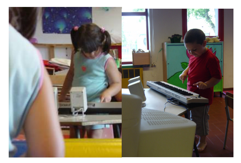
Figure 3: Focused attention. Two children observe with interest the keyboard, focus the attention on particular aspects (to play a single key, with a single finger or alternating two fingers), then listen.

• Focused attention: Analytical behaviour associates to the high levels of concentration, or like episodes alternated at relaxation moments (see Fig.3).