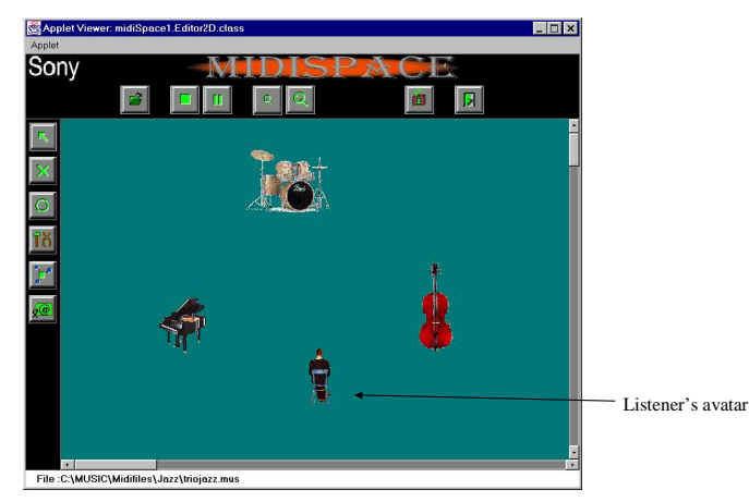
Fig. 2. The 2D Interface of MidiSpace. Here, a tune by Bill Evans (Jazz trio) is being performed

In the 2D interface of MidiSpace, each sound source is represented by a graphical object, as well as the listener's avatar (see Fig. 2.). The user may basically play a midi file (with usual tape recorder-like controls), and move objects around. When an object is moved, the spatializer is called with the new position of the object, and the mixing of sound sources is recomputed accordingly. Other features allow to mute sound sources, or select them as "solo".