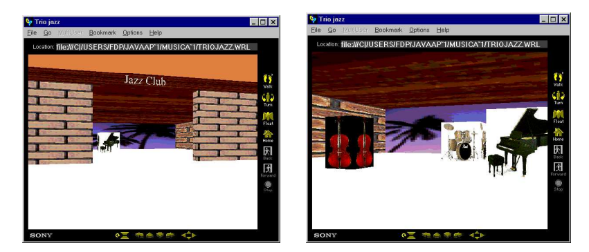
Fig. 3. MidiSpace/VRML on the Jazz trio, corresponding to the 2D Interface of Fig. 2. On the left, before entering, on the right, inside the club.

Instead, we chose to experiment with affordable, wide-spread technology. A 3D version of MidiSpace in VRML has been built (see Fig. 3.), in which the VRML code is automatically generated from the 2D interface and the Midi parser. The idea is to create a VRML world in which the user may freely navigate using the standard VRML commands, while listening to the musical piece. Each instrument is represented by a VRML object, and the spatialization is computed from the user current viewpoint. In this interface, the only thing the user can do is move around using standard commands; sound sources cannot be moved.